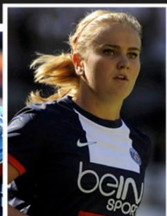
LINDSEY HORAN PARIS SAINT-GERMAIN